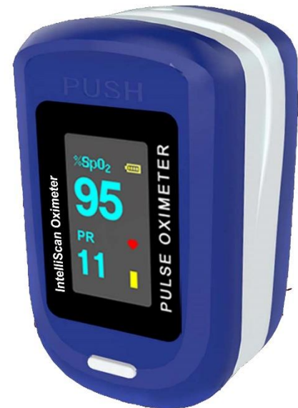
IntelliScan Pulse Oximeter Model CVD-M1002